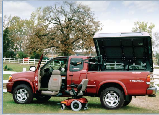
OUT-RIDER™ LIFT W/ POW'R TOPPER PACKAGE