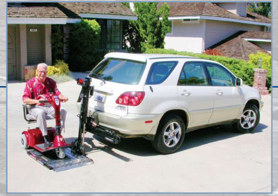
OUT-SIDER® MERIDIAN™ LIFT ASL-250