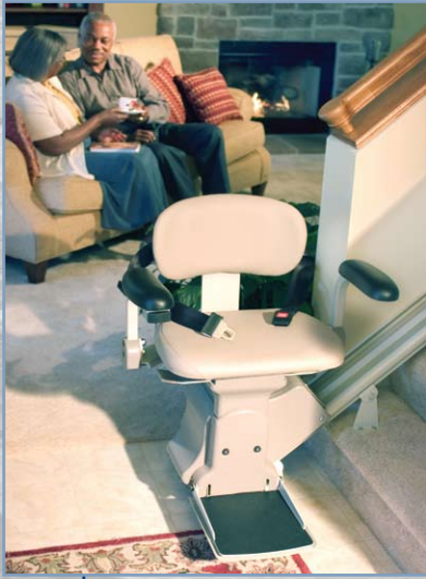
ELECTRA-RIDE II™ Model SRE-2750