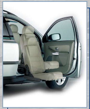
TURNY™ ORBIT® SEAT

Revolutionary Turning Automotive Seating™ (TAS™)