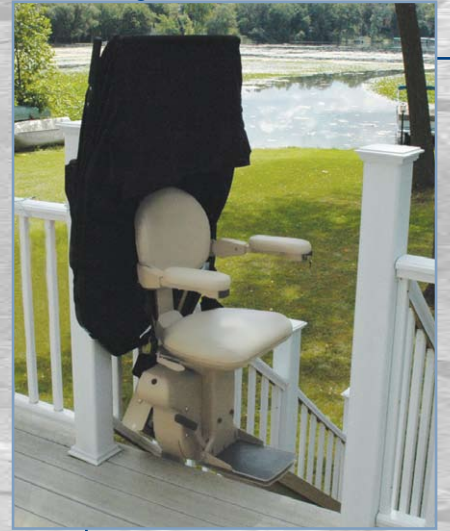
OUTDOOR ELECTRA-RIDE™ Model SRE-2010E The only 400 lb/ 181.8 kg capacity outdoor stairlift... an INDUSTRY EXCLUSIVE!