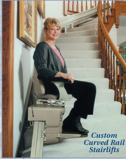
ELECTRA-RIDE III™ Model CRE-2100