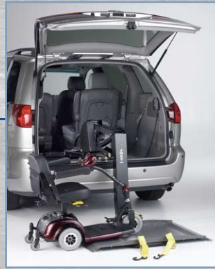
JOEY™ INTERIOR PLATFORM LIFT VSL-4000