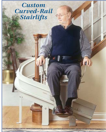
ELECTRA-RIDE III™ Model CRE-2100