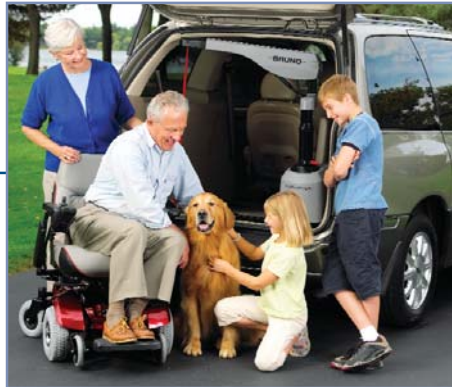
NEW CURB-SIDER™ VEHICLE LIFT VSL-672