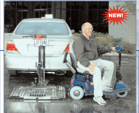
OUT-SIDER™ MERIDIAN™ LIFT ASL-250