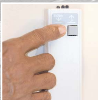
The two wireless call/send controls make installation simple and clean with no wires running along the wall.