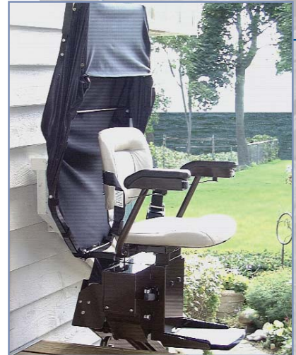
OUTDOOR ELECTRA-RIDE™ Model SRE-2000E

The only 400 lb. capacity outdoor stairlift... an INDUSTRY EXCLUSIVE!