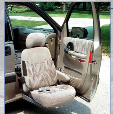
TURNY™ V (HD) SEAT

All illustrations and specifications in this brochure are based on the latest product information available at the time of publication. Bruno Independent Living Aids, Inc. reserves the right to make changes at any time without notice. Electra-Ride LT 10/05-3. © Bruno Independent Living Aids, Inc. 2005.