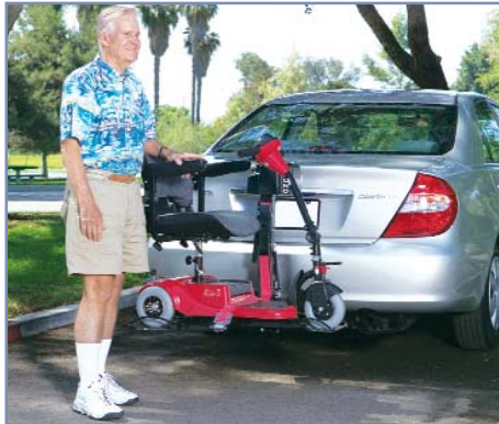
OUT-SIDER™ MICRO LIFT ASL-225

OVER 25 DIFFERENT Vehicle Lifts INCLUDING: