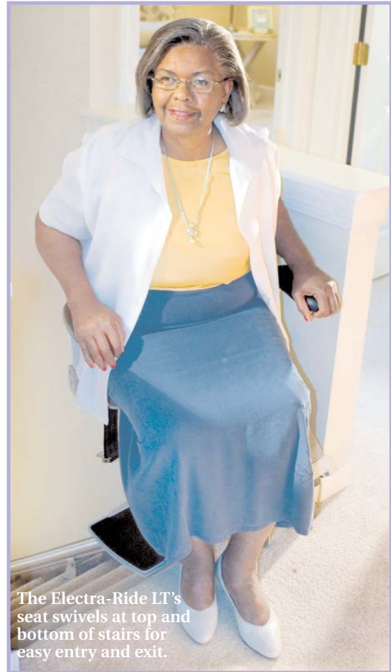
The Electra-Ride LT's seat swivels at top and bottom of stairs for easy entry and exit.