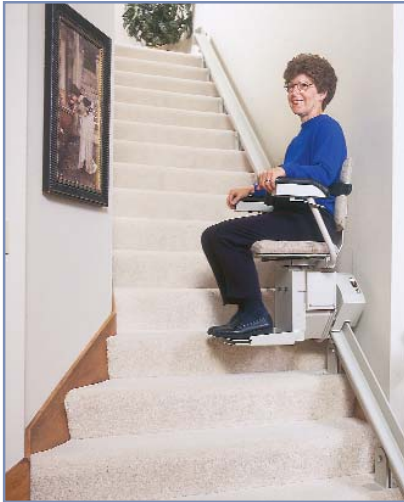
ELECTRA-RIDE™ ELITE Model SRE-2000

INDOOR AND OUTDOOR STRAIGHT-RAIL and CURVED-RAIL Stairlifts: